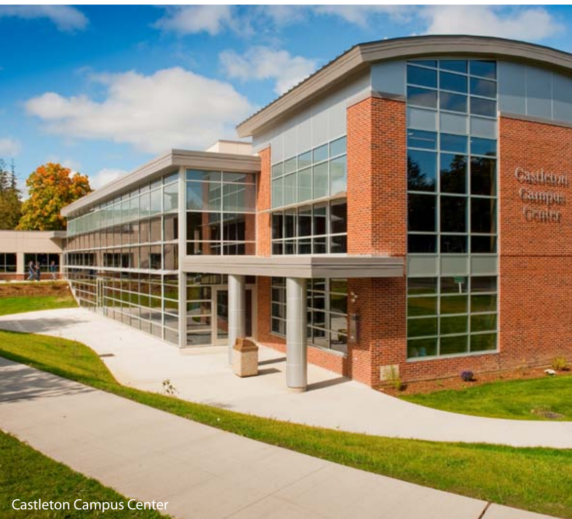
Castleton Campus Center