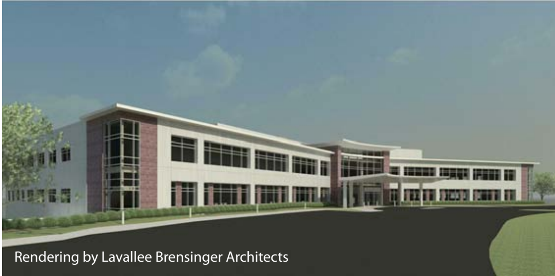
Rendering by Lavallee Brensinger Architects

This 102,000 square foot, three-story project will provide state-of-the-art services needed to meet the demanding standards of today's medical services. Each floor of the new facility will contain exam and treatment rooms, offices, and reception and waiting areas. Family medicine, general internal medicine, dermatology, the Sleep Disorder Center and a portion of outpatient rehabilitation will move to the new building when finished in fall 2012.