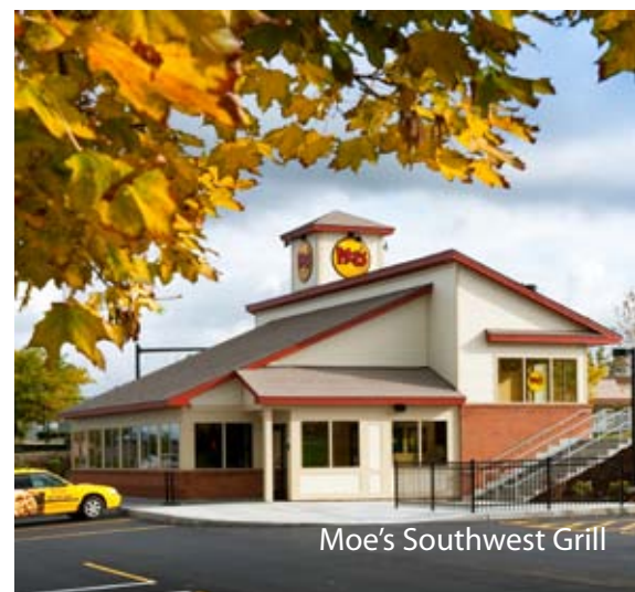
Moe's Southwest Grill