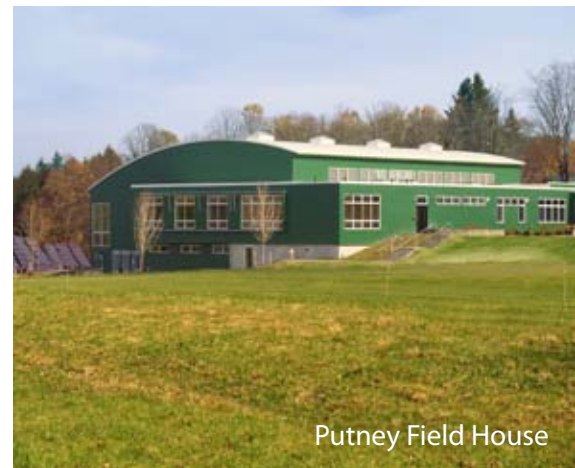
Putney Field House